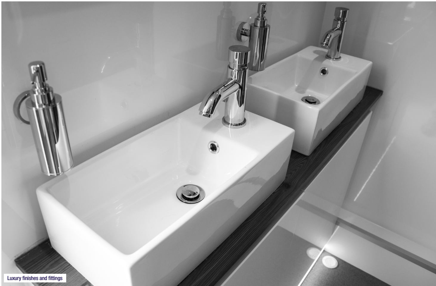
Luxury finishes and fittings