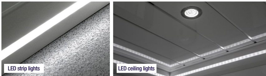
LED strip lights